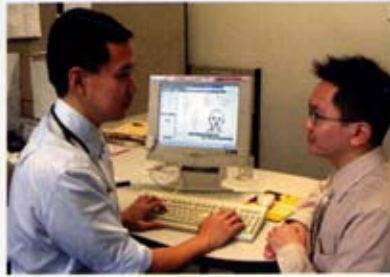
Doctors now key in diagnosis and prescription online.

During consultation, the doctors can perform the following functions: