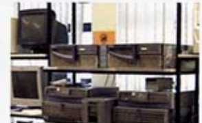
Medical records are all now in the server

waiting time in real time and has a job stack module for our doctors. All these modules are integrated with its administration modules including inventories, purchase orders and acquisition, and financial system.