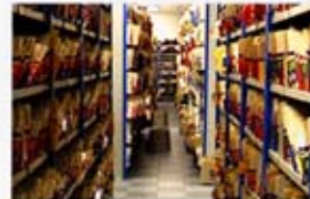
Medical Records used to be shelved in the Medical Records Room

Over the last 3 years, all 250,000 case records consisting of 2 million pages of records were digitised/scanned. Patient transactions are now done electronically, including on-line patient appointment system, self-registration kiosks, electronic medical recordings, order entries for laboratory tests, and prescriptions. The system also allows management to monitor patient load,