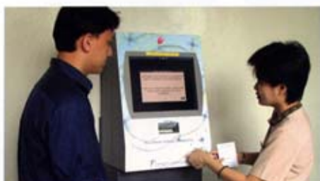
With the new system and self-registration kiosks, patients can get their queue number almost instantaneously by just scanning their IC or appointment card.

Gone were the days when long queues and stacks of papers were a common sight. NSC prides itself as the first medical institution in Singapore to go paperless.