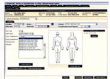
Nursing orders are also done through the system.