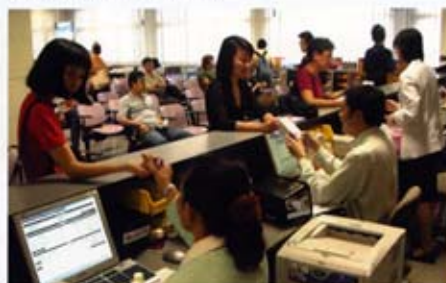
Scriptless dispensing in the pharmacy with EMR.

Besides reducing waiting time, the system is also capable of alerting the doctors if they have accidentally prescribed a drug that the patient is allergic to. In three to five years time, it will also be able to track which medication works best for each individual patient.