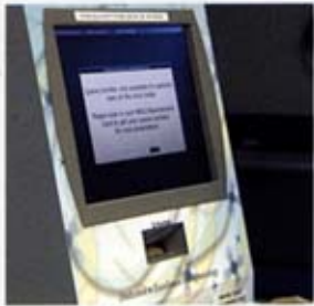
New self-registration kiosk

Before calling up the patient, the doctor can retrieve the patient's digitised past medical records from the EMR system.