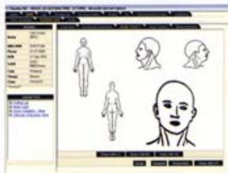
User friendly graphic interface for the doctors to key in their diagnosis.

A down time EMR module is available, where patients' medical transactions and records are downloaded into the doctors' PC every night. Should the system server break down, the doctors will still have access to basic information.